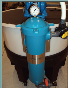
BAG FILTRATION FOR SEPARATING SOLIDS FROM DISCHARGE WATER.