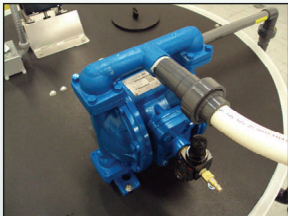
AIR DIAPHRAM PUMP USED TO FILL THE SYSTEM AND EMPTY AFTER THE PROCESS IS COMPLETE