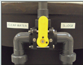
SEPARATE CLEAR WATER AND SLUDGE DISCHARGE FOR FASTER EMPTYING AND LONGER FILTER LIFE VIA THREE WAY SELECTION VALVE.