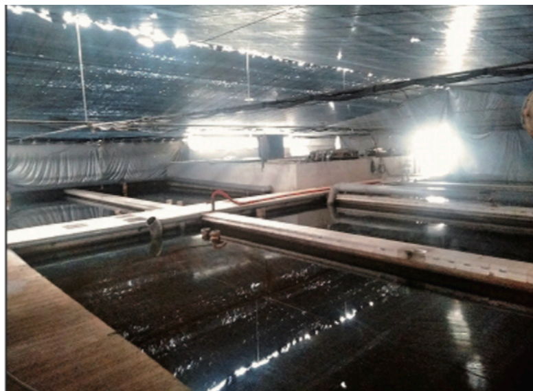
The Nagasaka Eel Farm facility

The first improvement was the introduction of an RAS (Recirculated Aquaculture System) that stops the need to discharge. However, this system requires a method of cleaning the water before/as it is recirculated. The solution to this challenge was to use Anzai's Nanobubble technology keeps the water rich in oxygen, clean and eradicates the need for a protein skimmer.