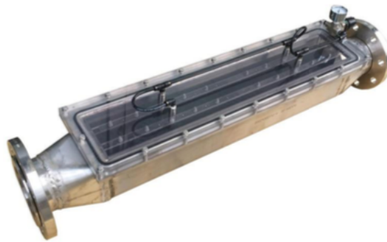
Anzai 100 A/S In-Line Nanobubble Unit

What is even more impressive is that this was achieved at the same time as an increase in the bio mass (density/breeding numbers) in the tanks which is now five times greater than previously farmed.